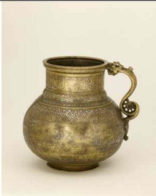
Wine-jug inscribed with Persian poetry, silver-inlaid brass, Herat (Afghanistan), 1461-62