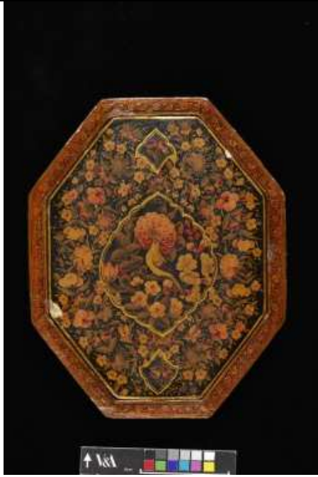
Octagonal mirror case depicting nightingale in roses, painted lacquer, Iran, 1747