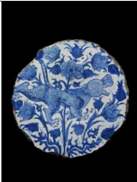
Fragment from large dish depicting a lion, glazed ceramic, Iran, 1600-1650