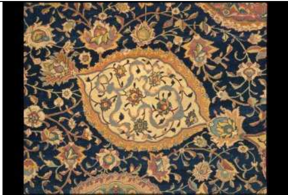
Detail from the Ardabil Carpet, woollen pile on silk foundation, Iran, 1539-40