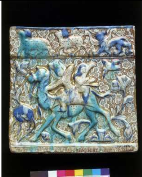
Tile depicting Bahram Gur and Azadeh, lustre-painted ceramic, Takht-i Sulayman, Iran, c.1275